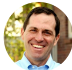
Jason Crow (D-CO)