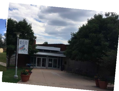
Littleton Historical Museum