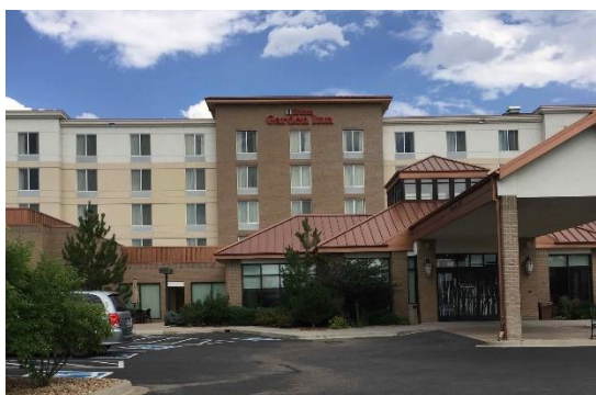
Hilton Garden Inn

“The AAUW Mission and Community Collaboration” is the focus of Saturday’s meeting. Your planning committee is seeking a dynamic and well know individual as the keynote speaker. That name will be announced at Public Policy Day, February 3, 2018. Sessions that include panel discussions and workshops on collaboration will create conversations that will begin the journey to community collaboration. We want everyone to leave convention with a wealth of ideas and strategies to take back to the branches. The noon luncheon features member recognitions and awards. “Save the Date” April 27 – 28, 2018 and join old friends and make new friends while living and practicing the Mission and passion of AAUW.