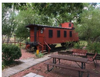
Littleton Art Depot